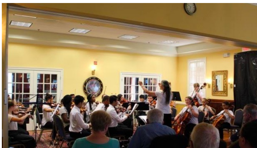
Meeting new audience members in Chesapeake.