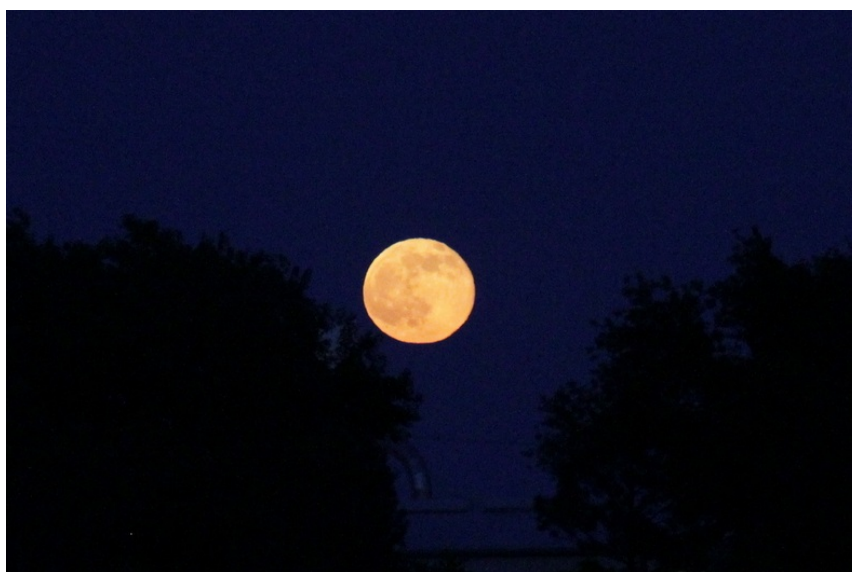
The strawberry moon.