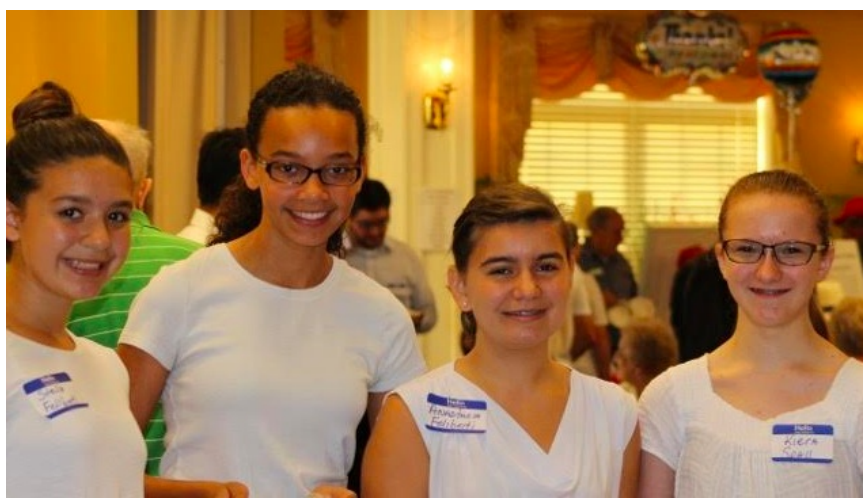
Orchestra members enjoy ice cream after their performance.