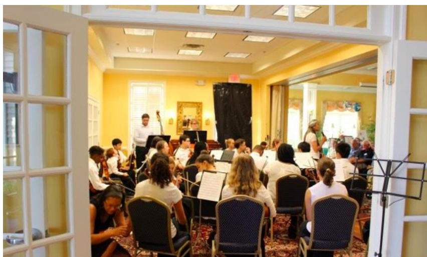
The space was perfect for an intimate concert.