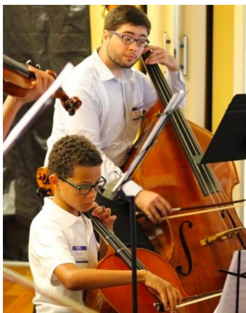
Current BYOV students and alumni performed together.